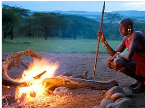
Honoring the (Benevolent) Warrior Within Celebrate the Inner You Who Has Given You Fight to Souldier On in Life soldier

I have a Warrior to thank. An inner warrior with a benevolent intention.